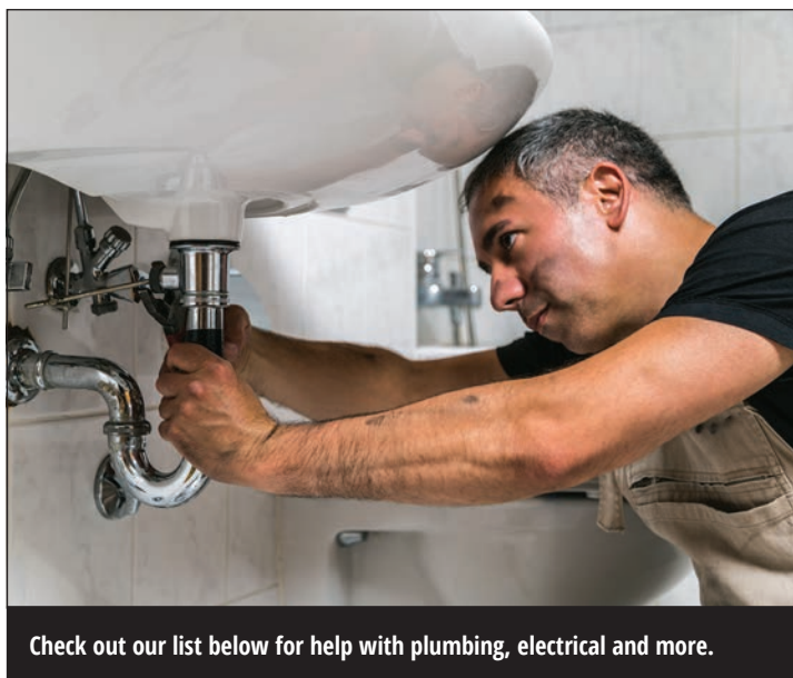
Check out our list below for help with plumbing, electrical and more.

Before diving into the list of affirming professionals, here are some smart strategies to make sure your next hire is the right one: