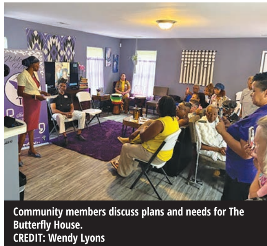
Community members discuss plans and needs for The Butterfly House.

To apply, learn more, volunteer, or donate, visit www.talkingsheets.org and click on The Butterfly House. Together, our Charlotte and surrounding communities can ensure that every woman who walks through its doors has the chance to heal, rebuild and soar to their next level.