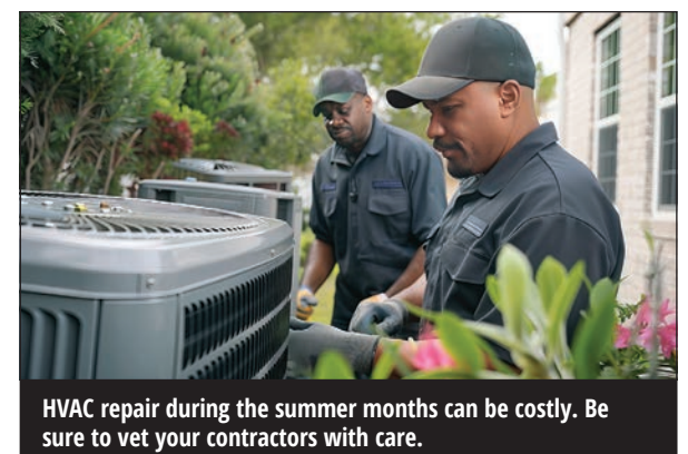
HVAC repair during the summer months can be costly. Be sure to vet your contractors with care.

Everywhere Is Queer https://www.everywhereisqueer.com/ Carolinas LGBTQ+ Chamber Member Directory https://www.clgbtcc.org/ Angi's LGBTQ+ Friendly Listings https://www.angi.com/ GayPages.com https://www.gaypages.com/ ::